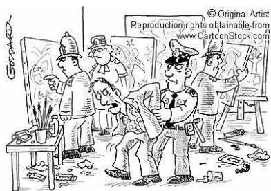
"An art forger? How dare you! I am an Henri Matisse tribute act!"